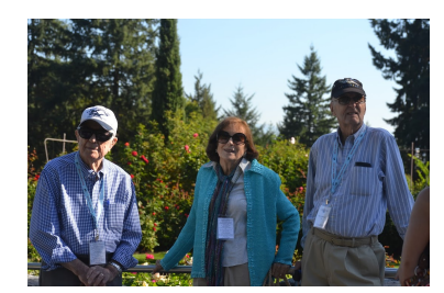
Our hosts arranged a visit to the Rose Garden and a wonderful bus tour of the city.