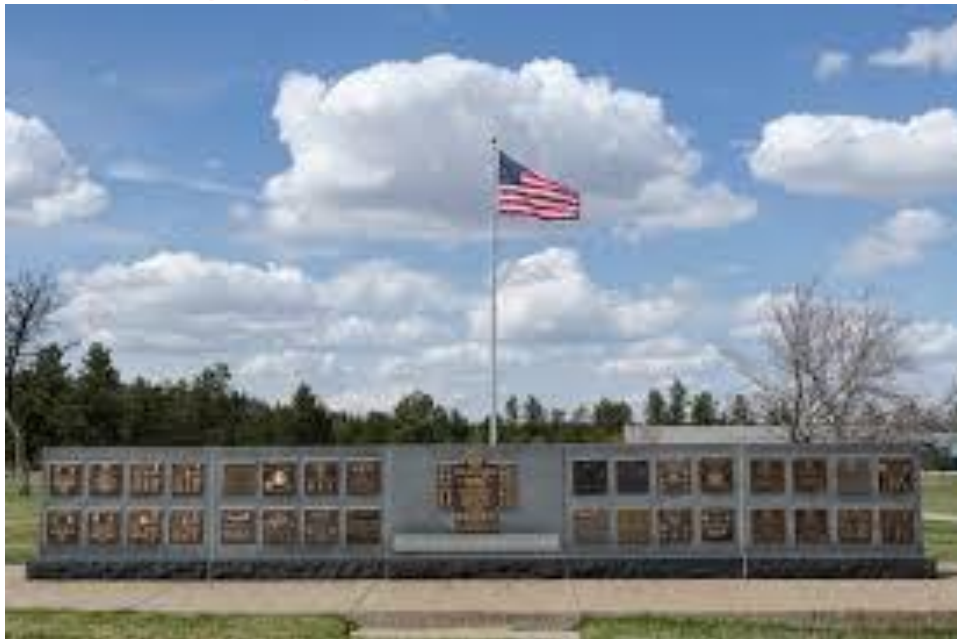
82nd Fighter Group Plaque Memorial Garden, USAF Academy Dedicated 1991