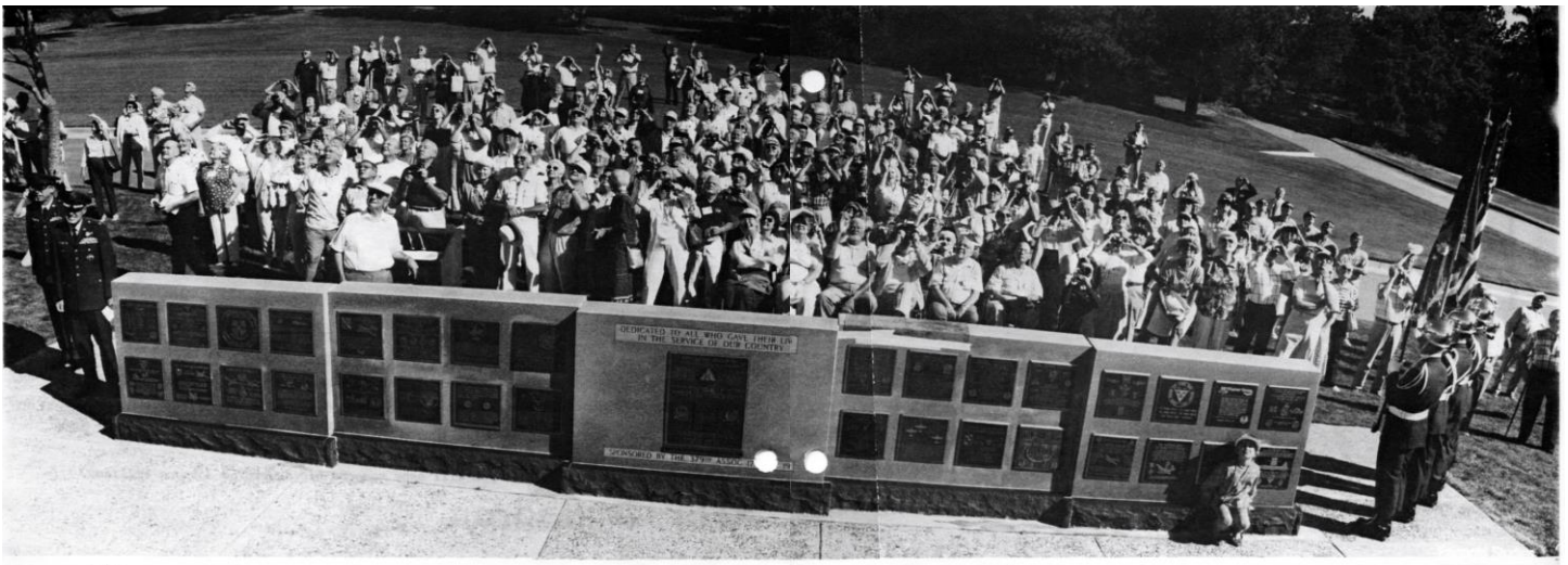
Flyover at Dedication of the 82nd Fighter Group Memorial Plaque USAF Academy Memorial Garden Denver Reunion 1991