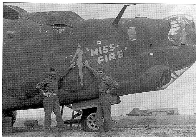
Miss Fire made emergency landing on Corsica, 12 July 44. She returned to squadron the next day.