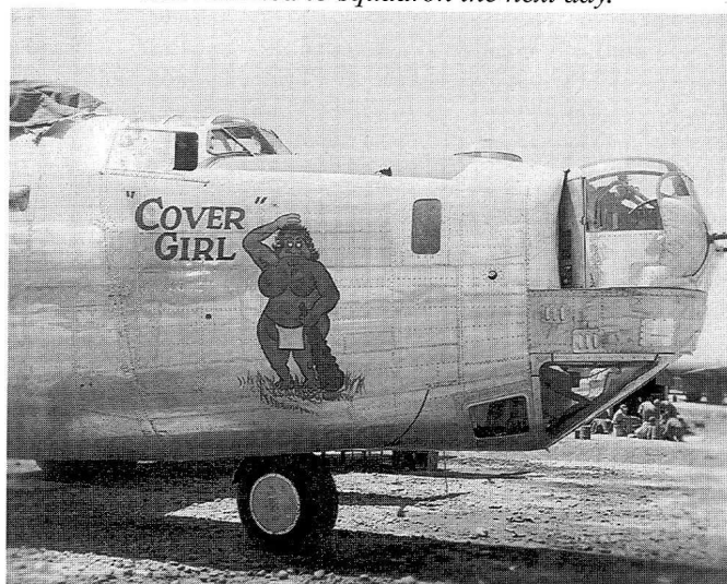
42-51684 "Cover Girl" made a crash landing on 1 November 1944 and was transferred to the 496th Service Squadron for extensive repair.