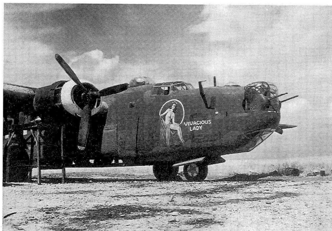
42-94741 "Vivacious Lady" as she looked after an early mission. She was lost on 13 June 1944.