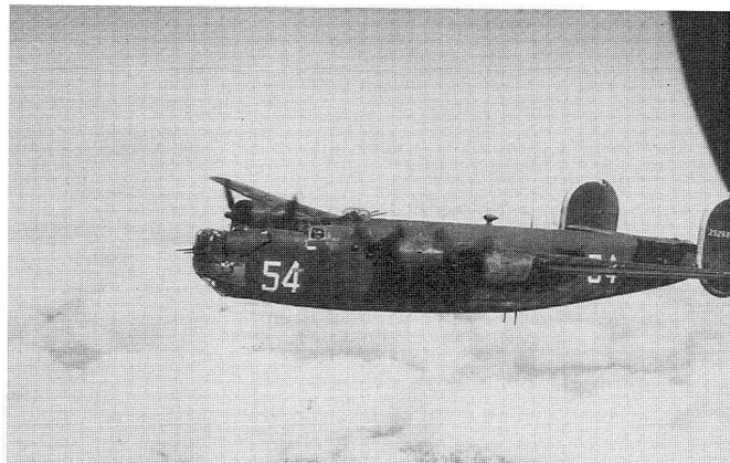
42-52684 "Umbrigo" Nose No 54, on a very early mission. Note: the insignias, and nose art have not been installed yet.