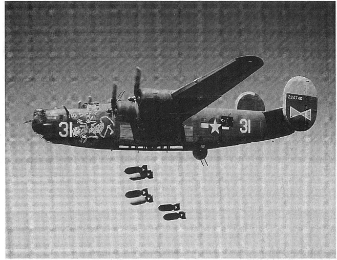
42-94740, A Ford built B24H of the 825th Sq. dropping 500 lb bombs probably in spring 1944. The fuselage does not show mud spattering