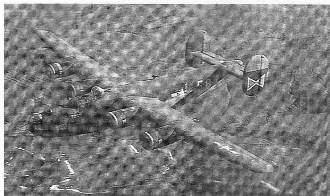
Miss Fire in Flight