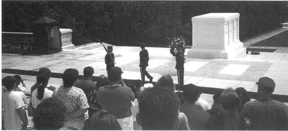
Changing of the guard at Arlington National Cemetery. Visitors walking up the hill to see this ceremony will pass the 484th tree and plaque at the junction of Grant and Roosevelt Drives.