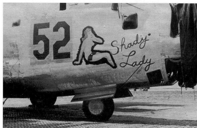
Ship # 52 "Shady Lady" 461st BG Lost 17 Dec 44

In reviewing my records on bomber losses on 17 December 1944 I have additional information on Lt Himmler's aircraft that was shot down that day. The 484th Bomb Group led the mission with 29 aircraft and by 0912 was at 9,000 feet over Bovino, 1003 at angels 16 over Split, 1215 at angels 24 bombs away.