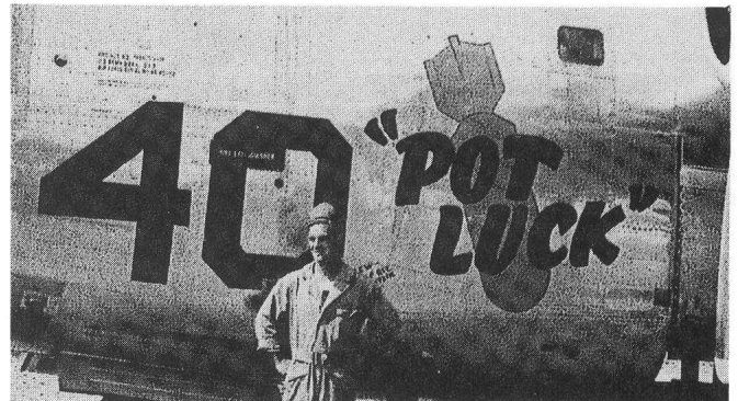
Ship #40 "Pot Luck." with Crew Chief (unknown)