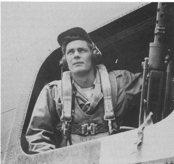
Who are They ?