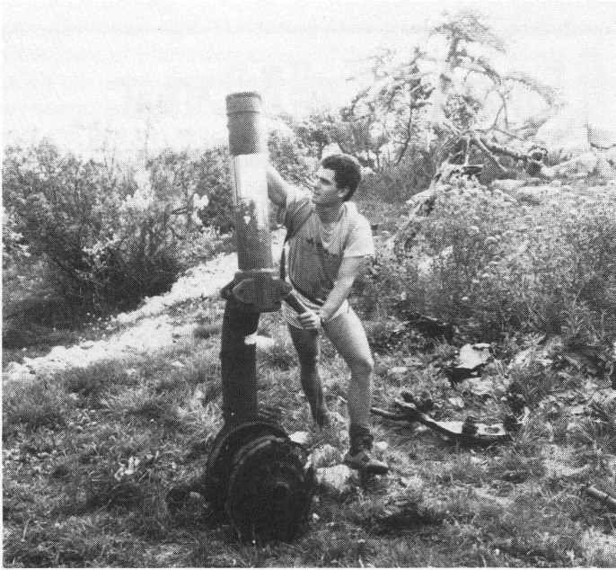
Photo above: Here is a picture of myself with the main landing gear strut.