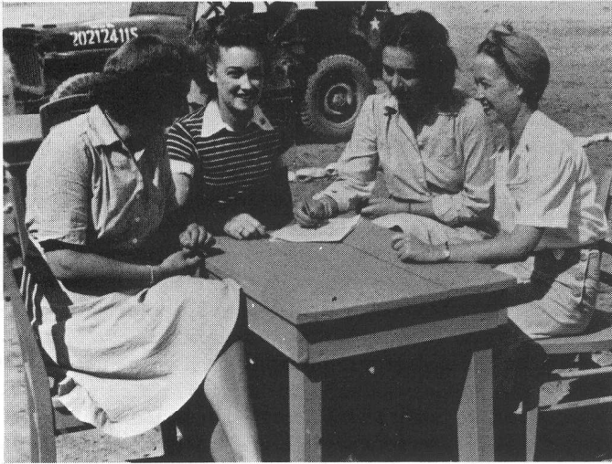
Red Cross ladies at Istres Airfield 1945