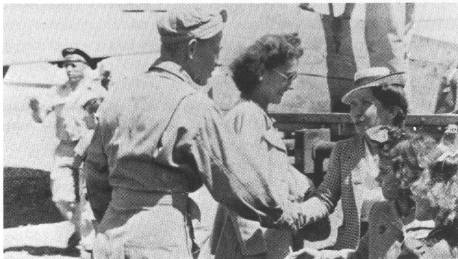
French refugees arriving at Istres from North Africa.