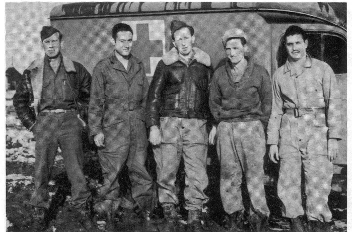
The Ambulance crew 484th Bomb Group poses for photo. Note the ever present Italian mud.