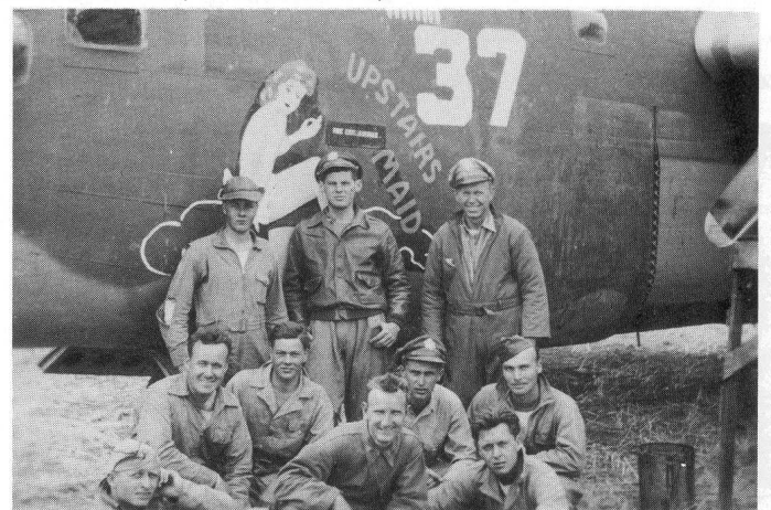
Crew of Upstairs Maid 875 Sq