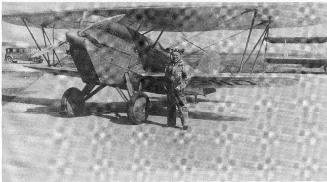
Jimmy Doolittle standing beside a Curtiss Hawk Pursuit