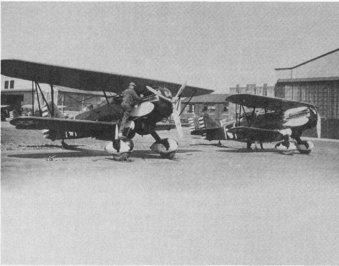
Mechanic at work on Curtiss P6-E of the 17th Pursuit Squadron Selfridge Field, Michigan (file photo)

the Air Service won two great aerial speed records, the Pulitzer Trophy and the Schneider Award. On October 12, Lt "Cy" Bettis flying a Curtiss R302 racer, won the Pulitzer Trophy with an average speed of 249 mile per hour. Two weeks later, Lt "Jimmy" Doolittle used the same plane equipped with pontoons to win the international Schneider race, averaging over 232 miles per hour. Not satisfied, Doolittle flew again the following day, this time averaging 245 miles per hour, a new world record for seaplanes.