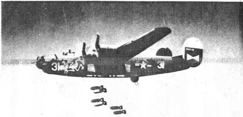
"Big Dick" from the 825 Sq drops its bombs. J R Porter crew, 825 Squadron