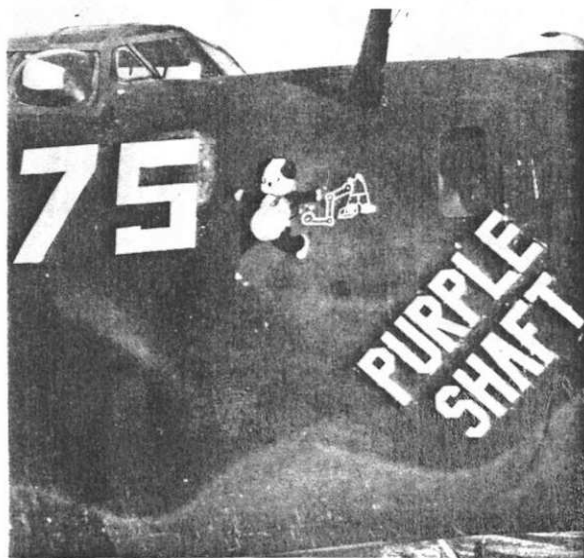
"Purple Shaft", 766 Squadron. A popular expression of the time. To get the shaft, one suffered an indignity of great proportion at the hands of the authorities