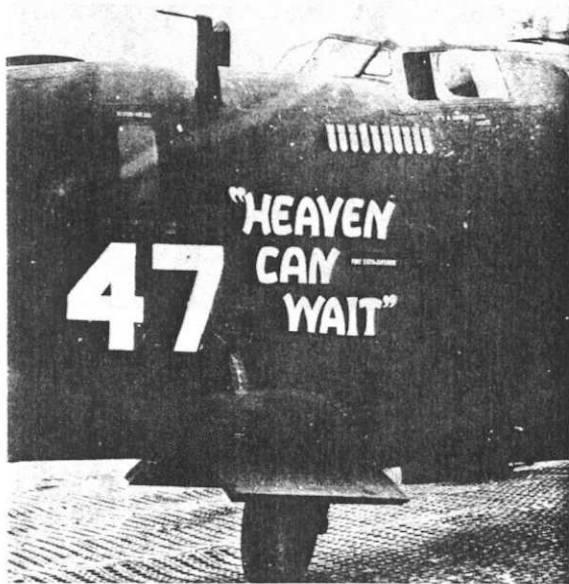
"Heaven Can Wait" 765 Sq.