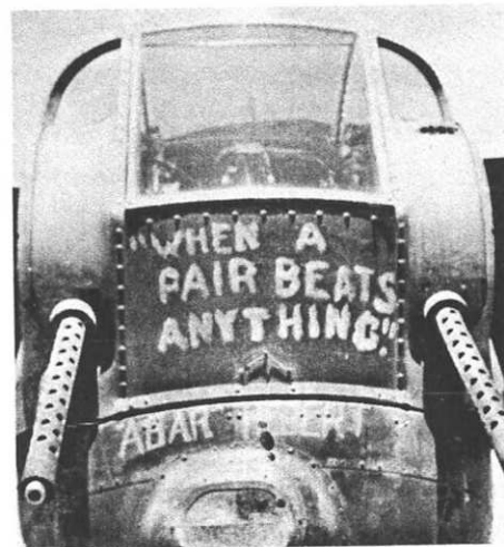
JOE HEBERT PHOTO (826) See Photo Page No. 32.