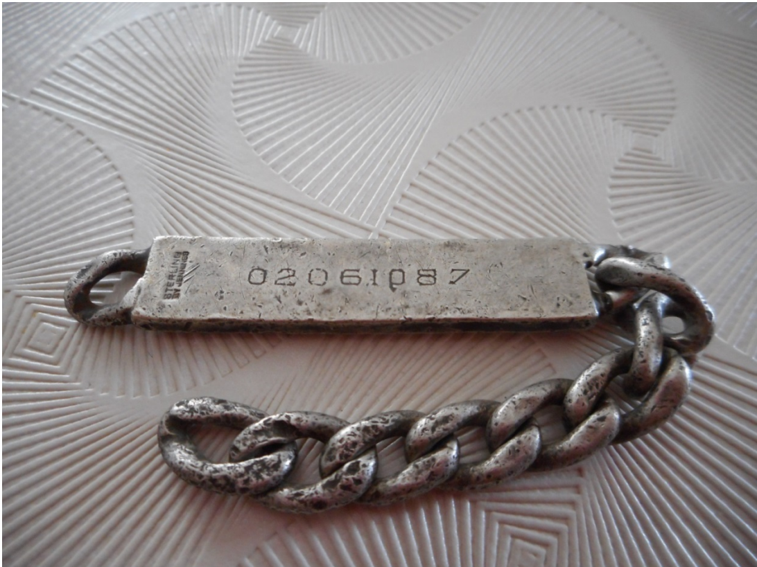
Picture 13. Silver wrist bracelet with serial number of 2Lt Galen L Warnock