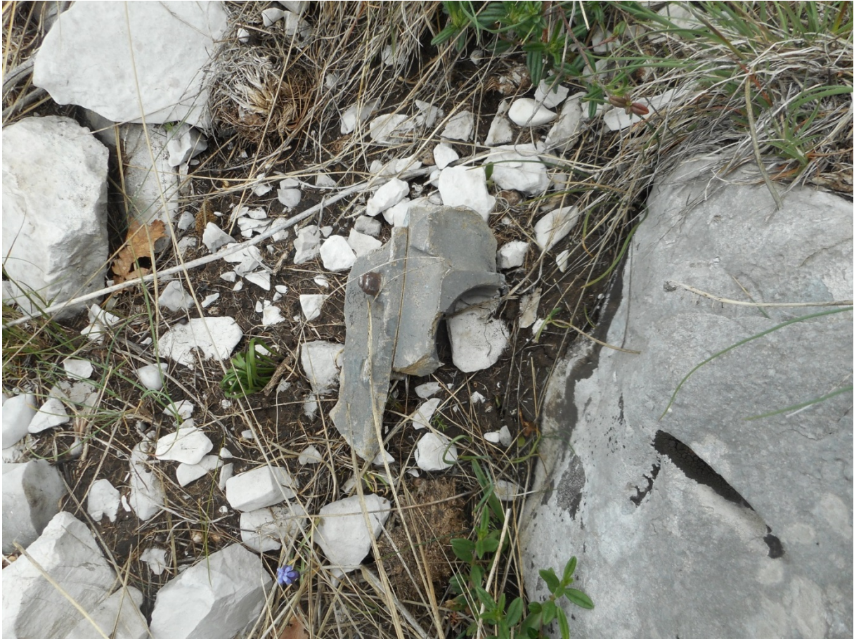
Picture 8. part pictured at the site and taken for further examination.

No parts with numbers from the aircrafts were found by now.