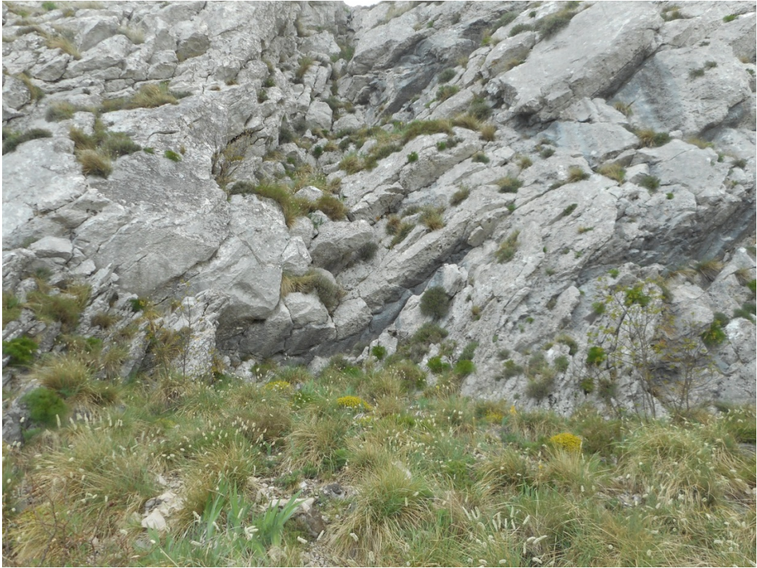
Picture 7. Possible ground zero close up