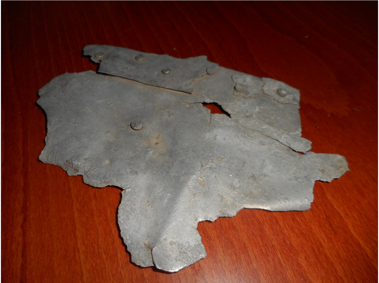
Picture 9. first discovered part