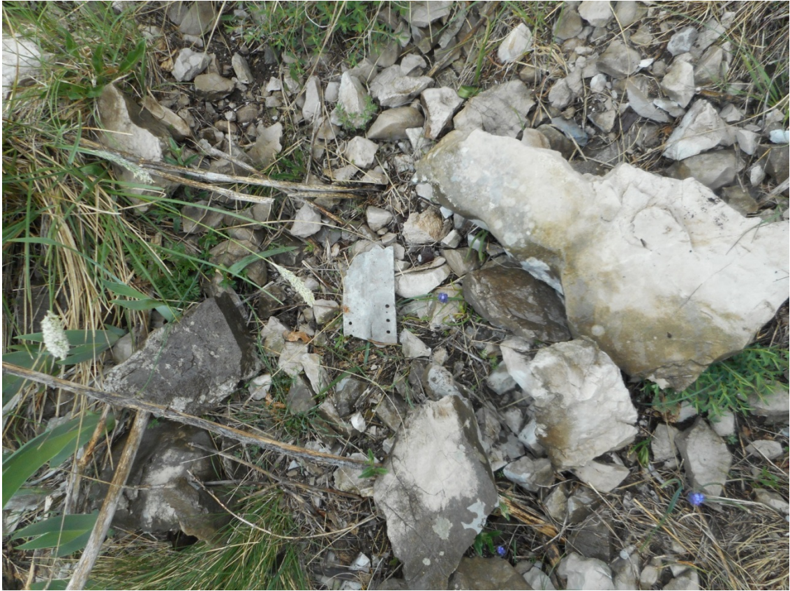
Picture 10. part at the site