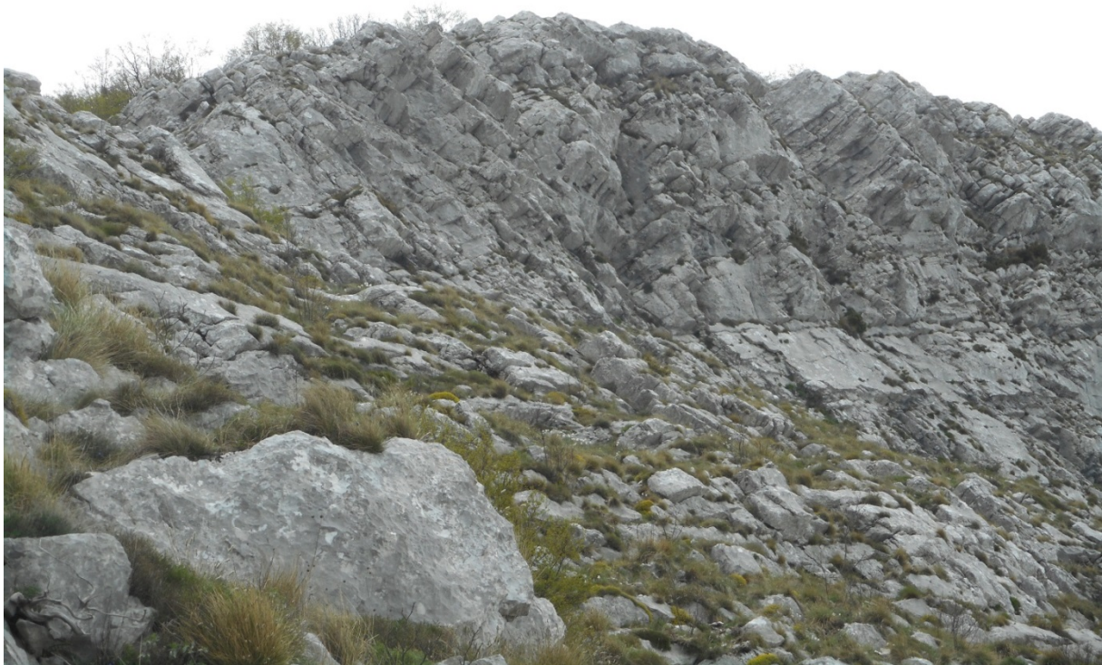
Picture 5. Cliffs on location