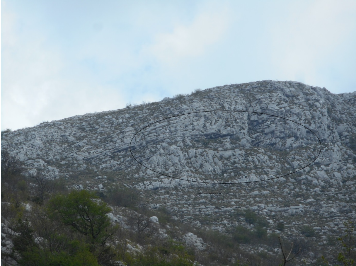
Picture 8. Location of the site ( from the suthern side from distance)