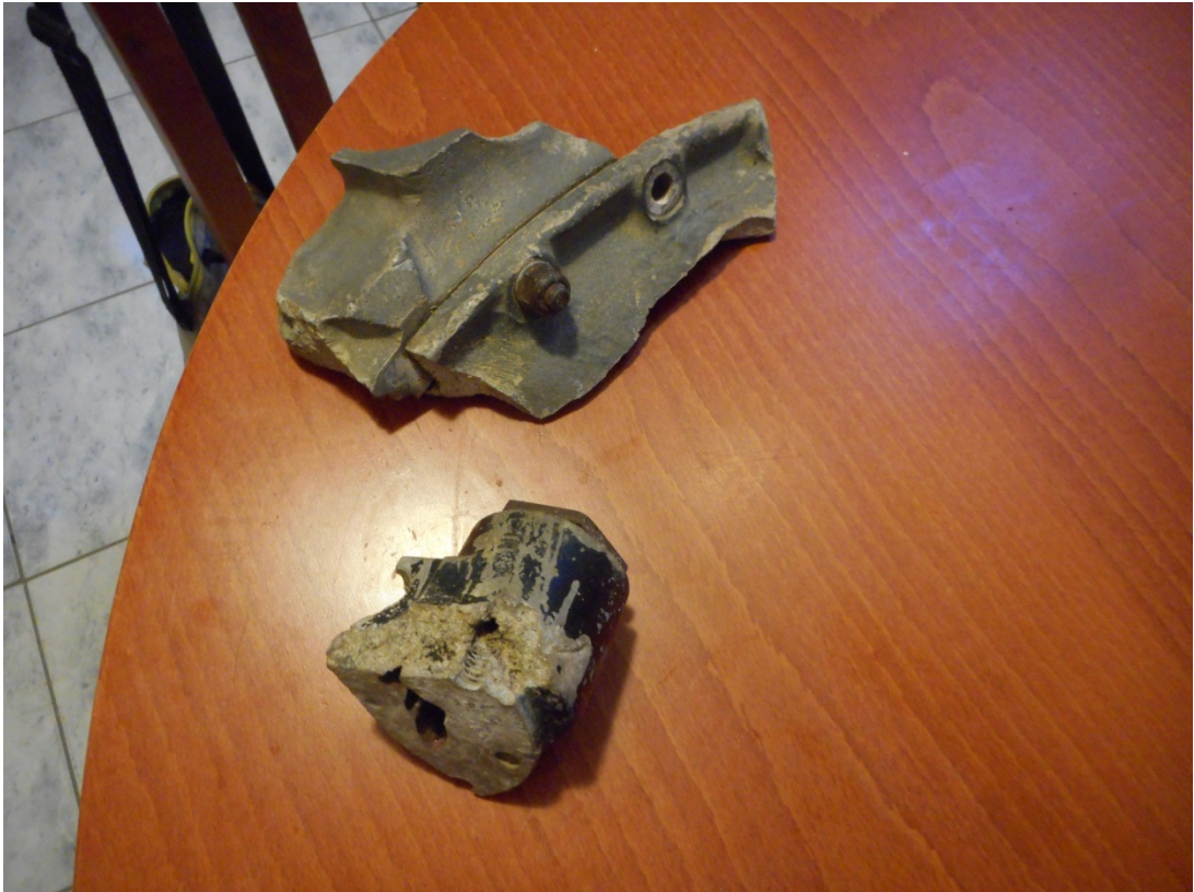
Picture 11. parts taken from the site