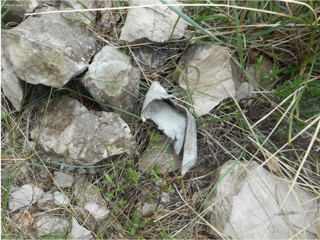
Picture 12. Part at the site