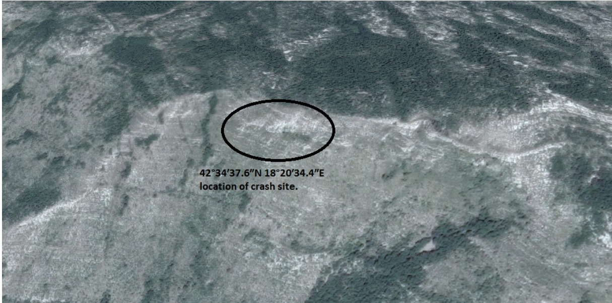
Picture 4. Coordinates of crash site