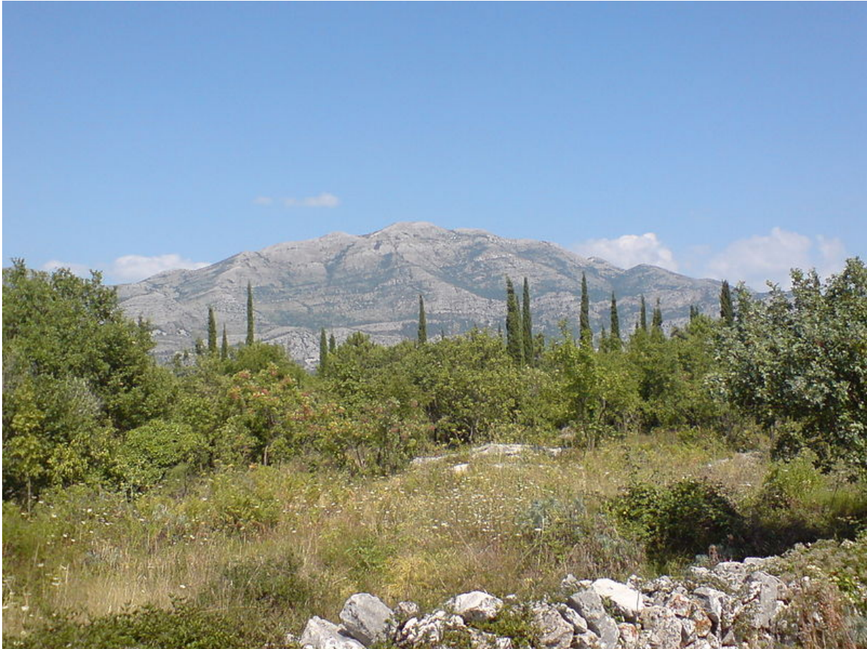
Picture 3. Mountain Sniježnica in Konvle region (Republic of Croatia)